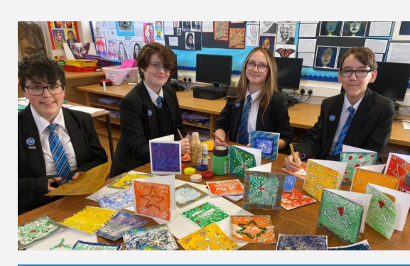
Students making Christmas cards for the Year 6 students to welcome them to our Academy.