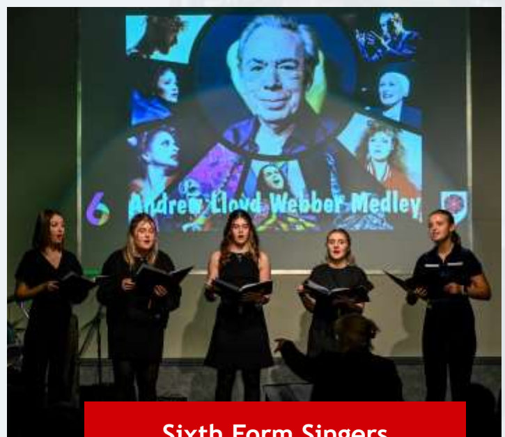
Sixth Form Singers