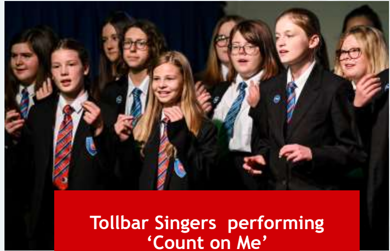
Tollbar Singers performing 'Count on Me'

Thank you to members of the Music department for organising the event.