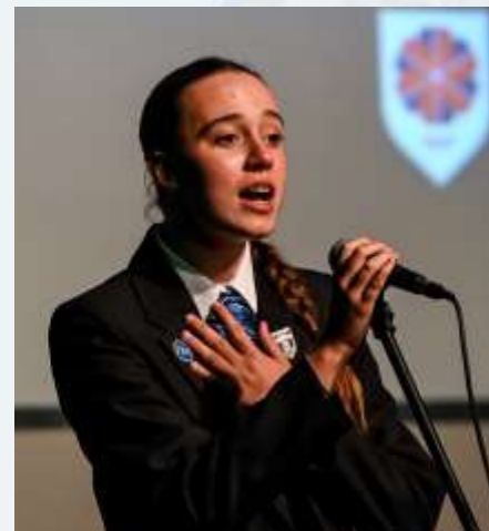
Poppy Indian performing 'Lost Without You'